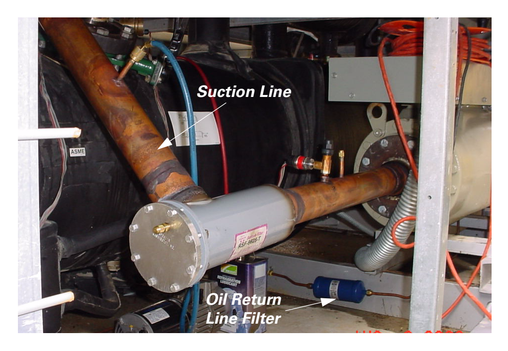
Figure 2: Temporary suction line with High Capacity filter blocks